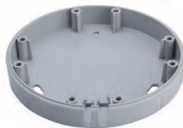
Plate with threaded screw holes for ceiling mounting